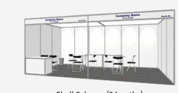
Shell Scheme (2 booths)